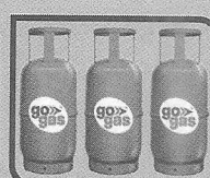
Packed Cylinder Marketing